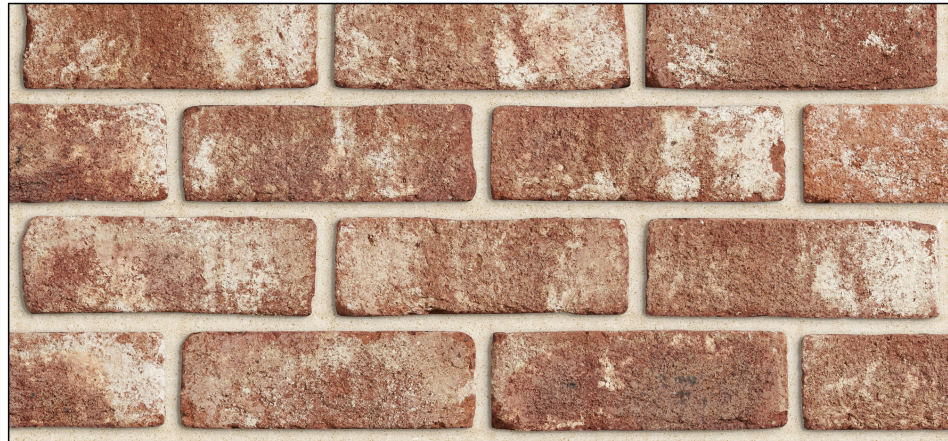
FACEBRICK - PGH - SANDSTOCKS BALMAIN TO EXT. WALLS