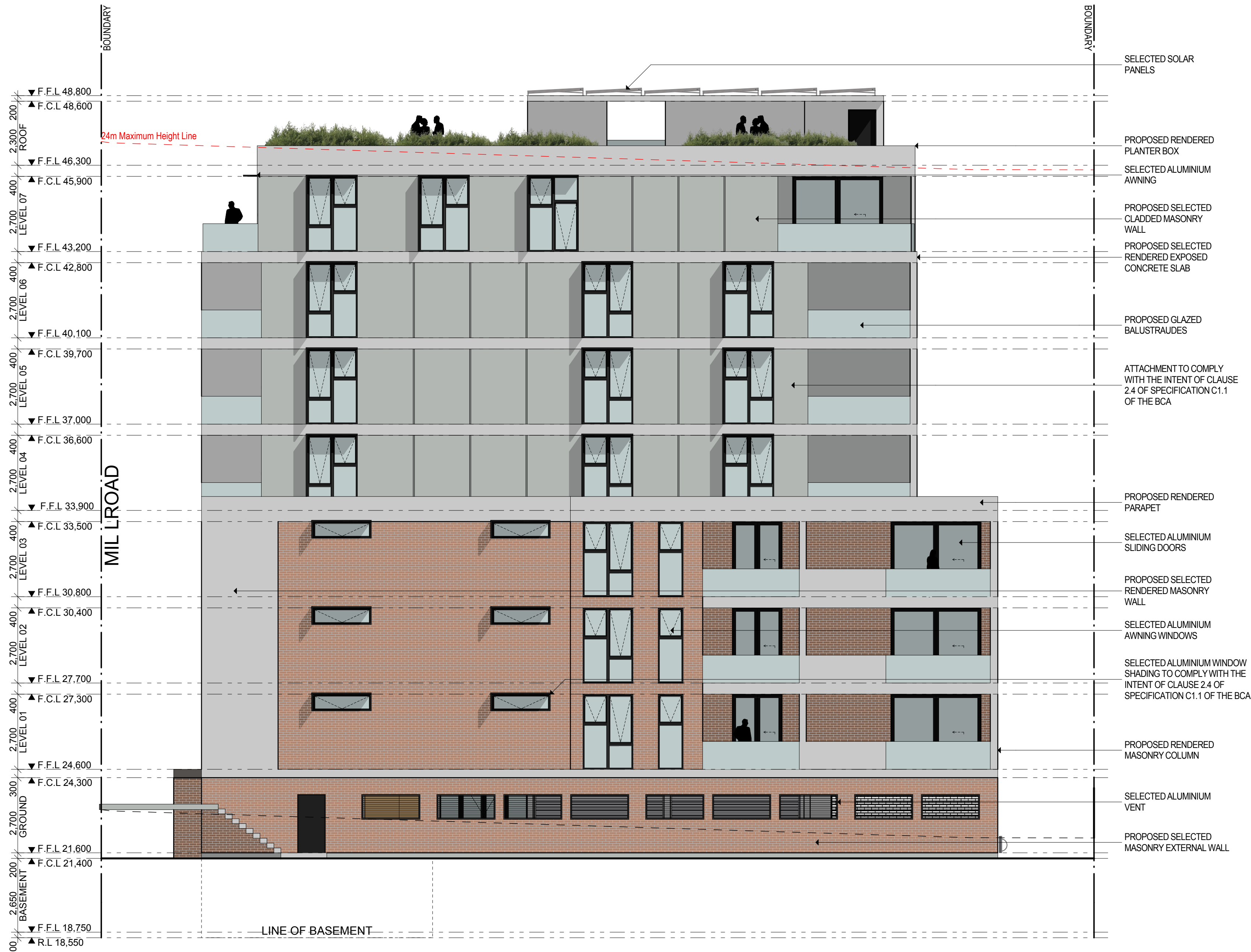
West Elevation scale 1:100